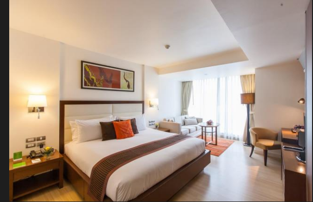
Studio Deluxe (34 sq. m.)

Room: Studio Deluxe (34 sq. m.) Rate: Single THB 2,400 / room / night include breakfast & WiFi Twin/Double THB 2,600 / room / night include breakfast & WiFi